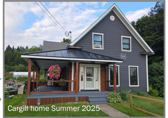
Cargill home Summer 2025