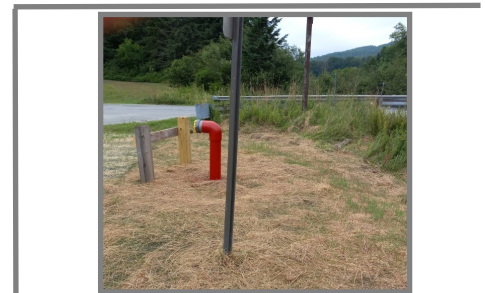
A new Fire hydrant has been added to the Boat Access area. We suggest contacting your Insurance agent as it may reduce your rating and rate !