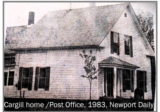
Cargill home /Post Office, 1983, Newport Daily