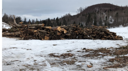
Logs salvaged from Stearns Brook flood debris