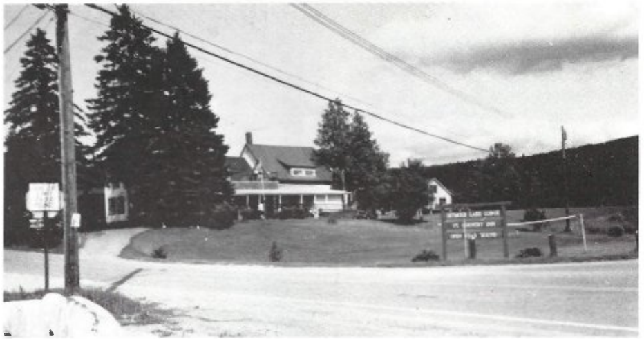
SEYMOUR LAKE LODGE