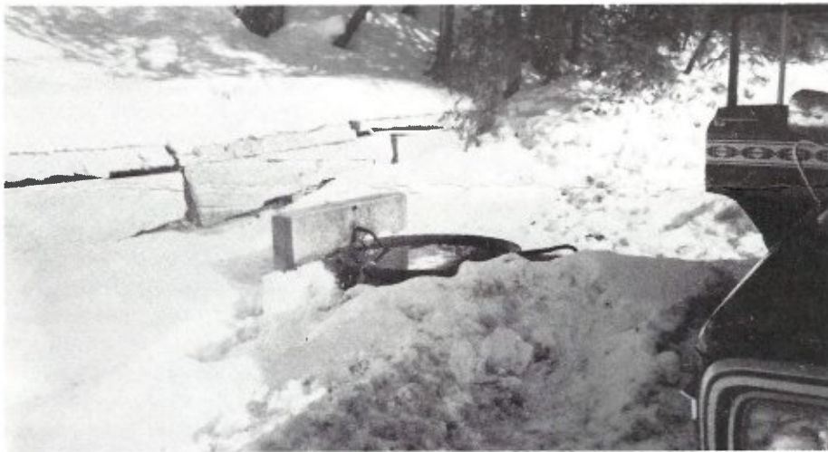
IRON KETTLE IN THE WINTER

We continued patrols on Seymour Beach for the summer months. Problems arose like they usually do, however, we did our best to curb the activities of a few who make a nuisance of themselves at the