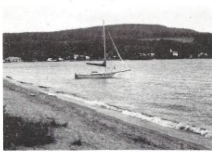
THE PUBLIC BEACH