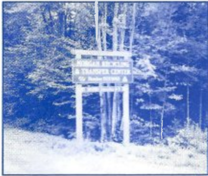
Morgan's Recycling & Waste Transfer Station Route 111 Open Saturdays 8:00 a.m. to 3:00 p.m.