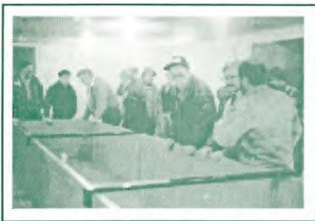
The inside story.