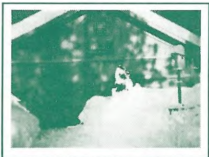
It's a four-season operation.

The value of being a member of the Federation of Lakes of Northern Vermont is the exchange of ideas for solving mutual problems; and, perhaps showing our legislature that we are quite a segment to be listened to in the preservation of our beautiful State.